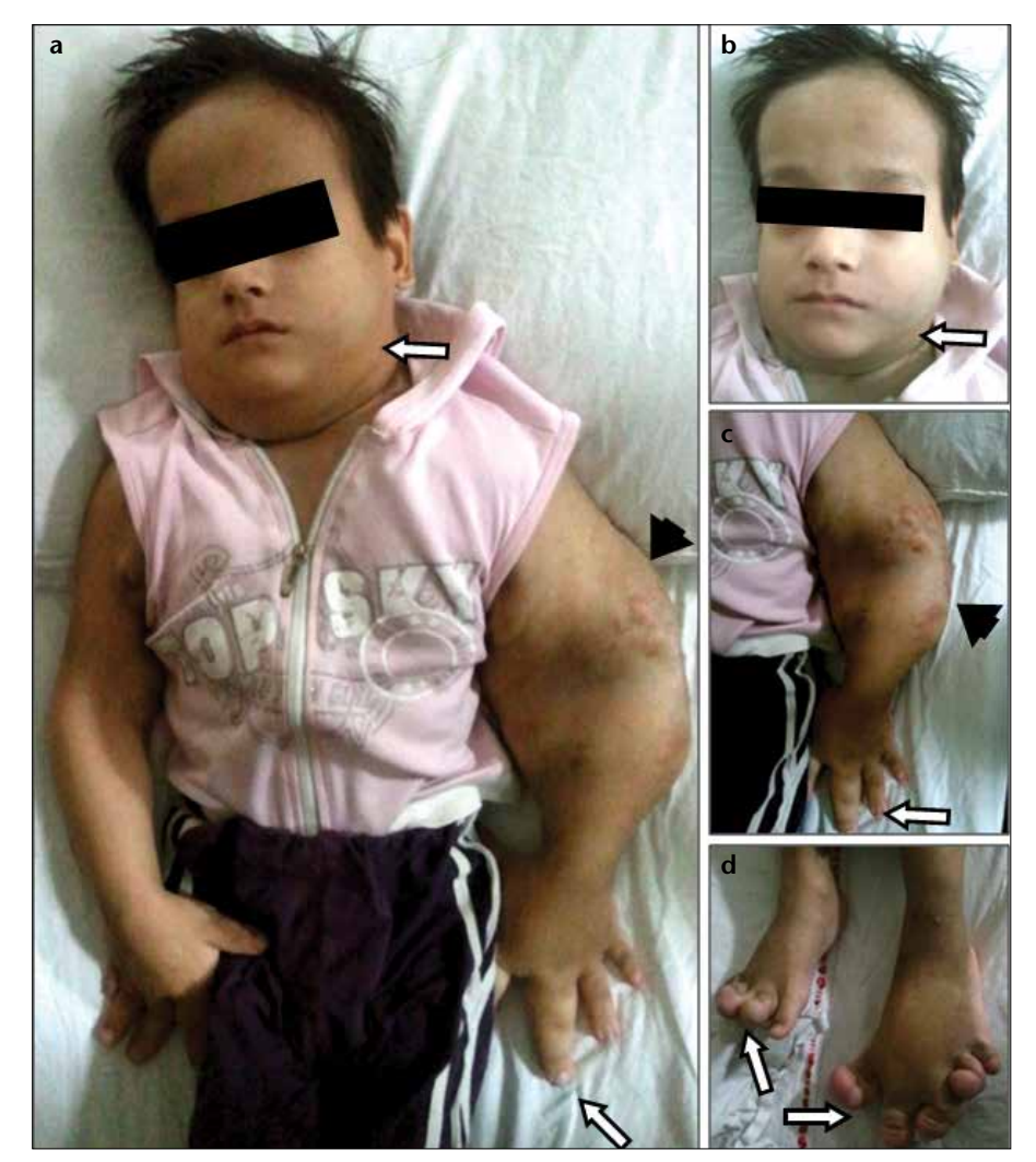
Figure 1. a–d. A six-year-old non-Asian Indian boy with Proteus syndrome. Features include typical facial phenotype; asymmetric, disproportionate, and progressive overgrowth of all the four limbs; lipoma at the back of the trunk (not seen in the picture); macrodactyly with abnormal bending of the digits of hands and feet ( white arrows ) ( a–d ). The left upper and lower limbs are affected more than the corresponding right counterparts. Patient presented with a recent history of progressive swelling of the left shoulder extending to the left chest, left arm and forearm, along with fever. The swelling was tender and hot on touch with scaling, erythema, and serosanguinous discharge from the overlying skin ( black arrows ) ( a , c ).

consent was obtained from the parents for the use of identifiable photographs. There was no neurological deficit. The shoulder swelling was tender and hot on touch, and there was serosanguinous discharge. Visible veins were also noted over the swollen chest on the left. Routine blood examination revealed leukocytosis and anemia.